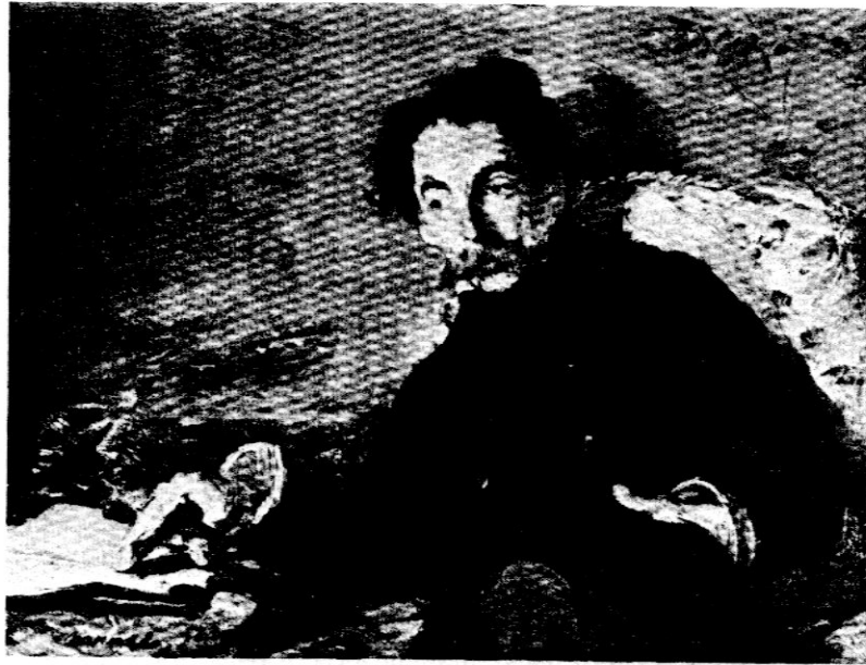
Stéphane Mallarmé, by Edouard Manet. Paris, Louvre.

cussions, in their very uncontrollable and unanticipated nature, still continue to evolve even in the very process of the testimony.