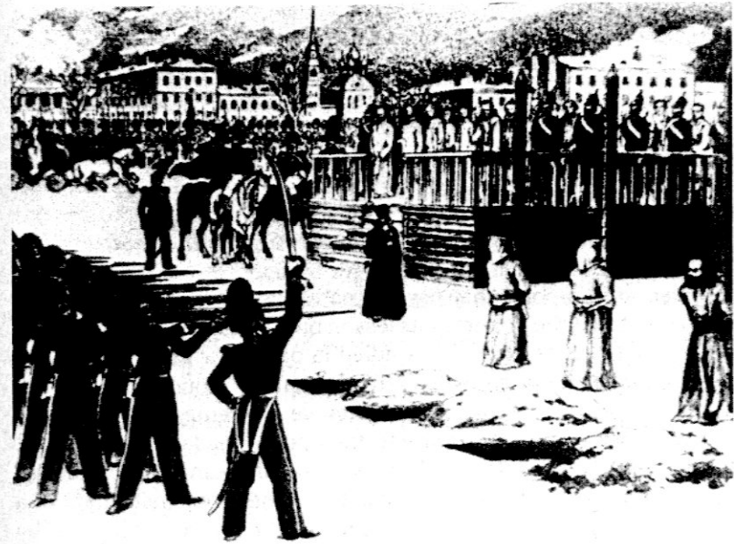
Before the execution.

In thus presenting us with the "confession" of an illness that spites healing and does not seek cure, Dostoevsky's testimony, unlike Camus', seems to find its predilection in the clinical in a manner which subverts its very raison d'être and with such an exclusivity as to entirely preclude any larger perspective, any political or historical preoccupation. And yet, the clinical description, although crucial, is also crucially deceptive, and does not truly exhaust the testimonial stakes of Dostoevsky's text, whose complexity encompasses unwittingly a latent historical dimension: even through its very title, Notes from the Underground (1864) is written as a latent echo to a work Dostoevsky published two years earlier, Notes from the House of the Dead , in which the writer testifies to his historical and autobiographical experience as a political prisoner in a penitentiary in Siberia. Dostoevsky's early writings had placed him politically as a Russian liberal. Having joined a liberal circle of enthusiastic young men who met to discuss socialism, Dostoevsky was arrested, accused of complicity in a conspiracy (to set up a printing press), and condemned to death. The sentence was commuted to imprisonment, but, in a calculatedly cold-blooded farce devised by the tsarist authorities for