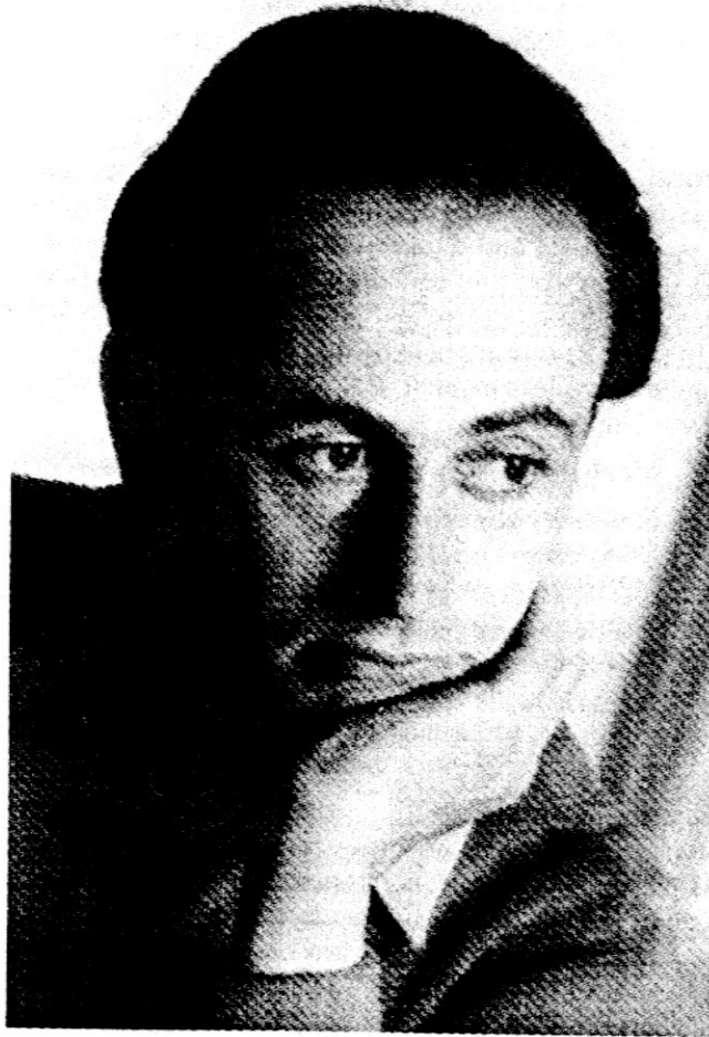
Paul Celan, 1947/48, age twenty-seven

The quest for musical precision—which shuns melody and which refrains, above all, from “poeticizing”—is, however, coupled with a tendency toward silence. “Tendency toward silence,” notes Celan, “—this, too, can’t be said just so. We mustn’t create new fetishes. Even the anti-fetish can become a fetish.” 33