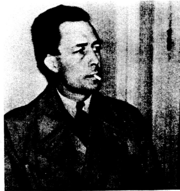
Albert Camus as editor of "Combat," World War II

So did we, in class, focus, at the start, on this historical dimension. Surprisingly, however, the historical event fails to exhaustively account for the nature of the testimony, since the bearer of the testimony is not simply a "historian" but, primarily, a doctor , and since history appears, and is recorded, in the striking metaphor of a disease, a plague. Since the testimony dwells on historicity as a relationship to death, and since the act of writing—the act of making the artistic statement of the novel—is itself presented as an act of bearing witness to the trauma of survival, the event to which the testimony points and