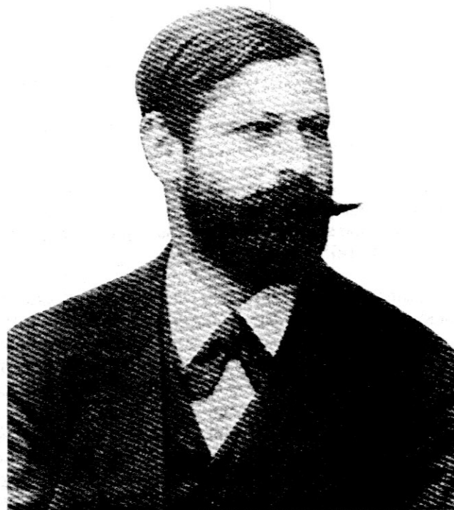
Sigmund Freud in 1891, age thirty-five.