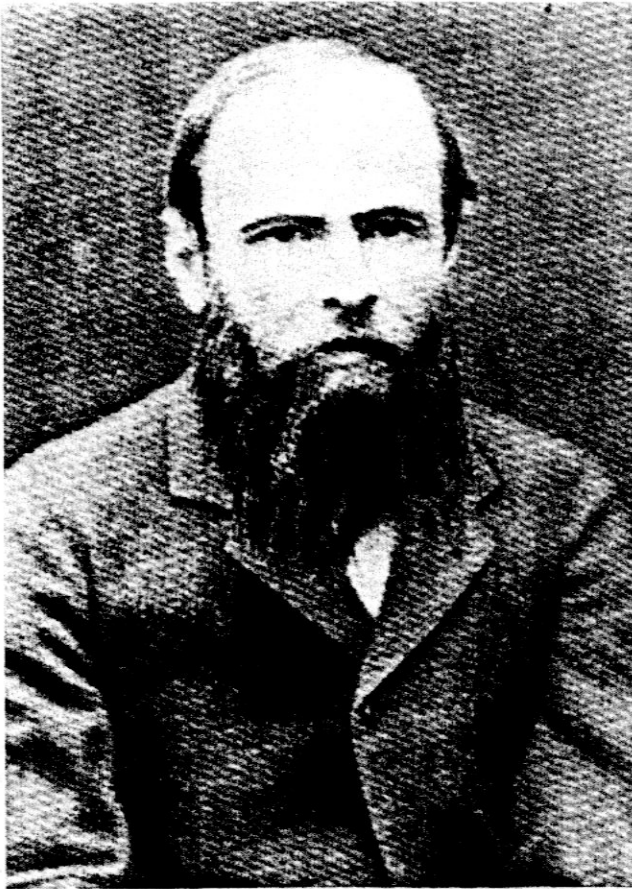
Fyodor Dostoevsky, 1880

under treatment and never have been, although I have great respect for medicine and doctors. Moreover, I'm morbidly superstitious, enough, at least, to respect medicine. With my education, I shouldn't be superstitious, but I am just the same. No, I'd say I refuse medical help just out of contrariness. I don't expect you to understand that, but it's so. Of course, I can't explain who I am trying to fool this way. I'm fully aware that I can't spite the doctors by refusing their help. I know very well that I'm harming myself and no one else. But still, it's out of spite that I refuse to ask for the doctors' help. So my liver hurts? Good, let it hurt even more. 8